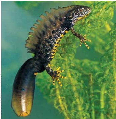
Each Great crested newt can be identified by a unique 'fingerprint' of black spots on its underside.

Wepre's woodlands are ancient and untouched by man. They are the last remnant of the great Ewloe Forest, which stretched down to the banks of the River Dee in the 11th century. Wepre's woodland floor has never been cultivated or built on, and its meadows and ponds have never been improved or drained.