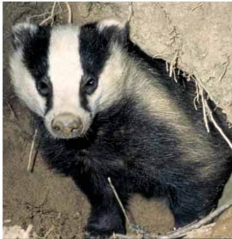
An adult badger can live up to 14 years, and weigh as much as 18kg.